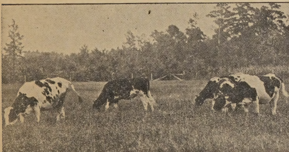
For Quick Grazing, Plant Wood's Grain Pasture Mixture

Sow at the rate of 100 pounds per acre. Price, $6.50 per 100 pounds.